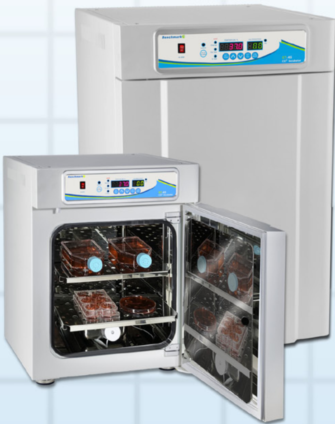
ST Series (ST-45 and ST-180)